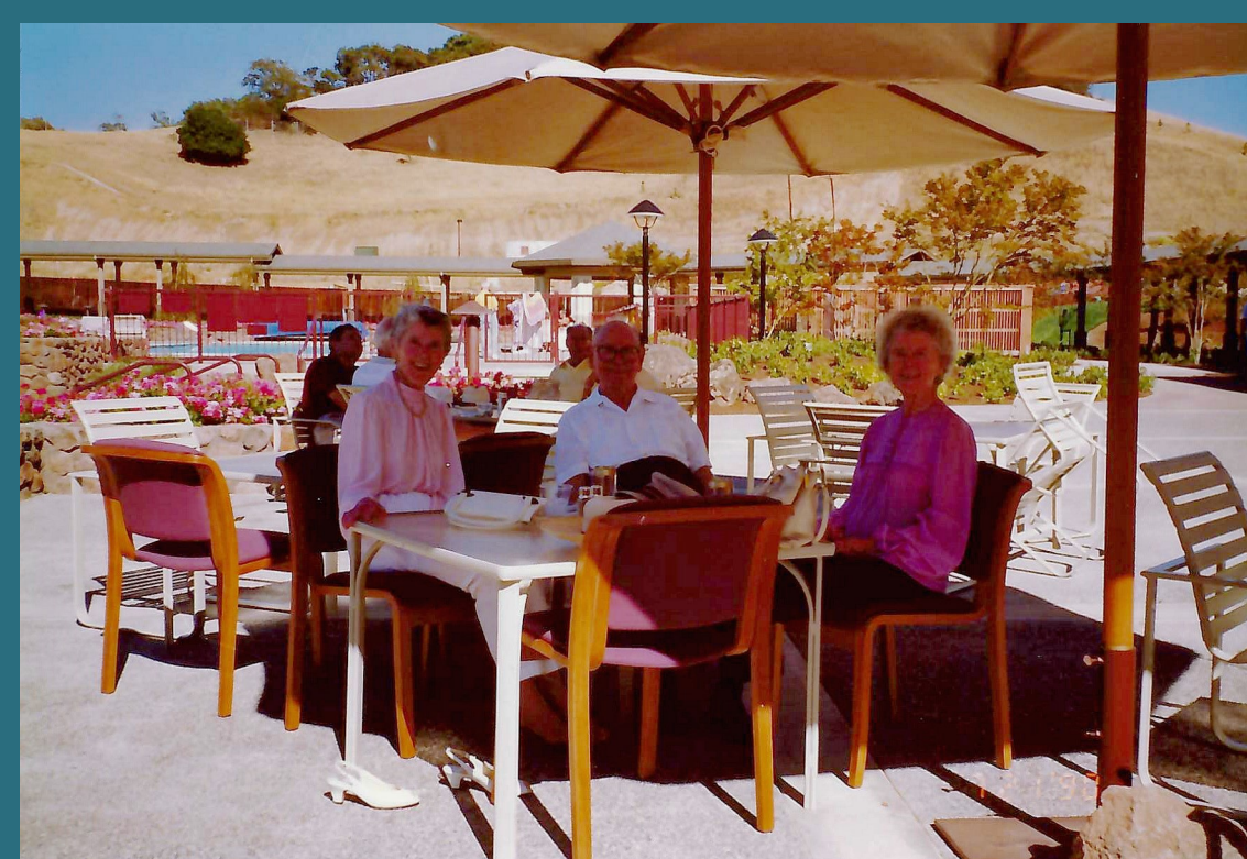
Newly landscaped areas.