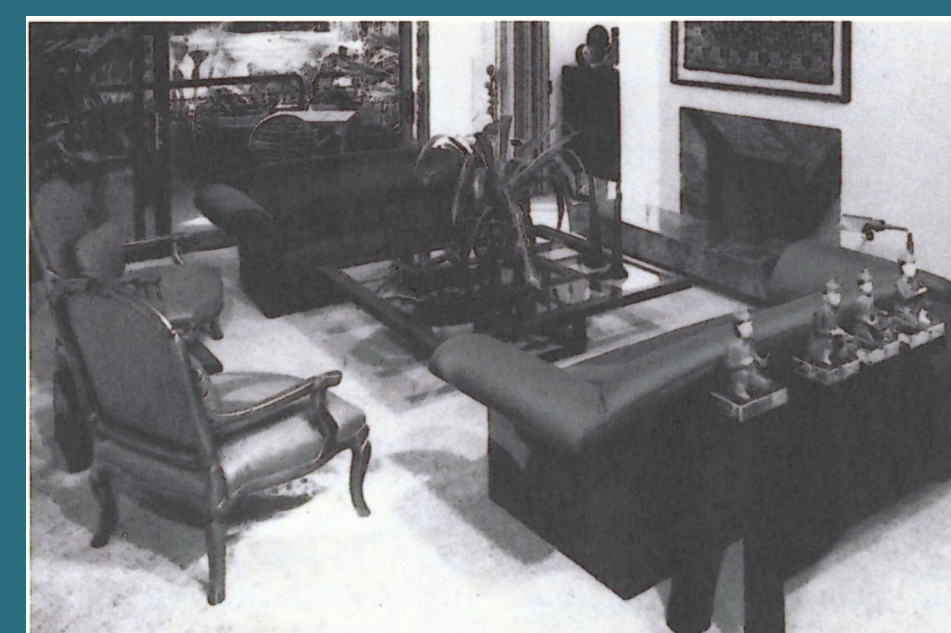
Exquisite living room designed by Ericksons foretells elegance and ambience awaiting Smith Ranch residents.

impressive list of previous clients includes the the award-winning Terraces at The Vintage Club in Indian Wells, CA, the Boca Raton Beach Club in Florida, the Biltmore Hotel in New York, Snowmass at Aspen and the William Sonoma store in Costa Mesa, CA. Other notable clients include Richard Nixon and former Secretary of Defense Robert McNamara.