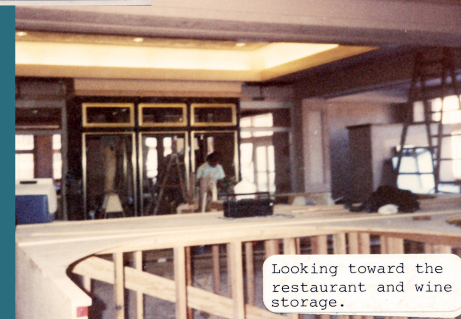
Looking toward the restaurant and wine storage.

The grand opening of the Clubhouse was held May 2, 1990.