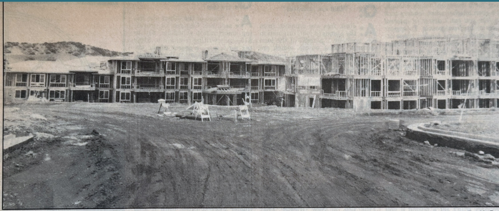
LIVING WITH CARE: Smith Ranch Homes, a Tishman Speyer Mediq condominium development, is expected to begin opening its 236-unit complex in November. Located on 40 acres off Smith Ranch Road in San Rafael, the complex will offer a restaurant, cocktail lounge, clubhouse, on-site health care and fitness programs. The units range in price from $250,000 to $560,000.