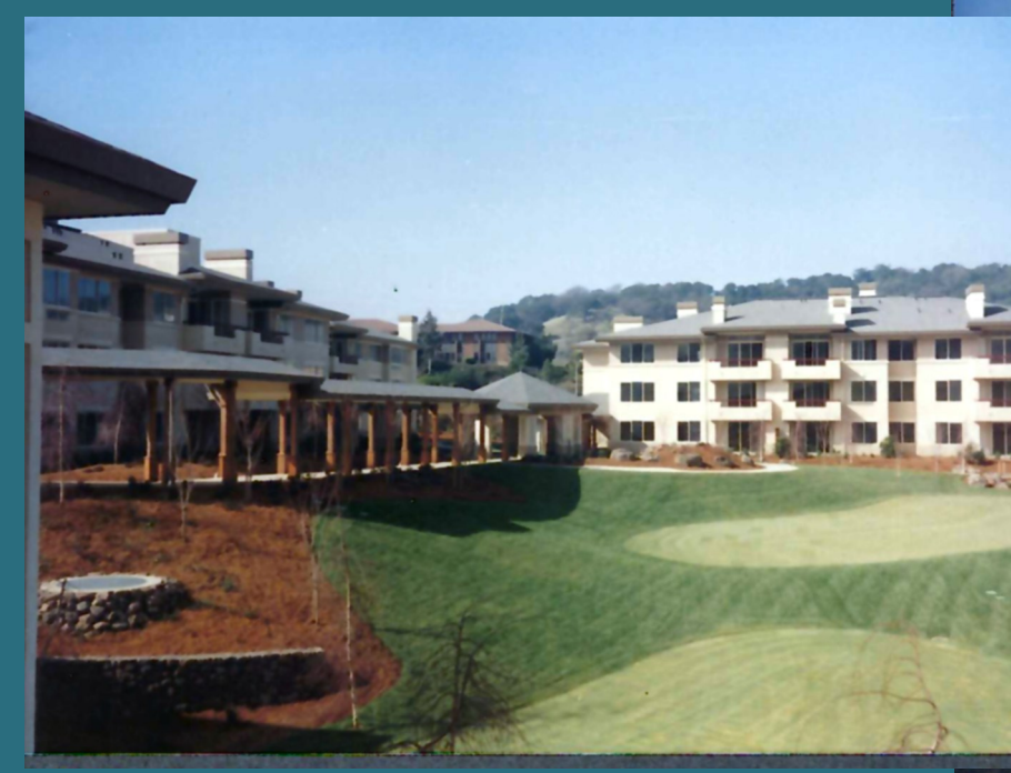
February 1990, residential buildings completed.