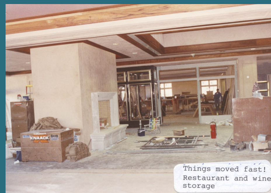
Things moved fast! Restaurant and wine storage