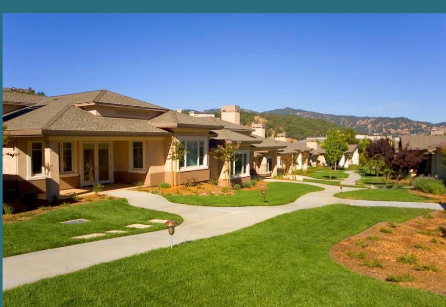
Phase II Villas by Pacific Union Development Co.

The 25 Villas were developed in two phases by TRI Development Co. and Pacific Union Development Co. and completed in 1998 and 2004.