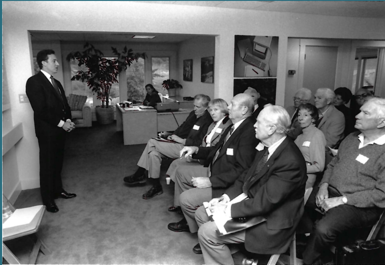
Two-hour complimentary lifestyle seminars were held in Spring 1989 at Larkspur Landing covering a range of topics.

A sales office for Smith Ranch Homes opened in January 1989 at Larkspur Landing where a scale model, photographs, and renderings of interiors and finishings were displayed and lifestyle seminars were presented. In July, the dedicated sales team moved to the new sales pavilion in Building 100 where they could show prospective buyers the model units.