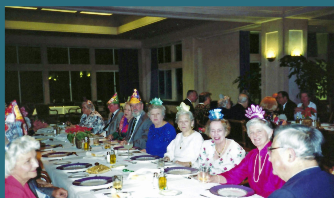
Celebrating Smith Ranch style.

A group of unattached women, who called themselves "The Loose Ladies," frequently enjoyed a lively dinner together. There was also a "Breakfast Club" and a group of gentleman diners who dubbed themselves "The Grumpy Men."