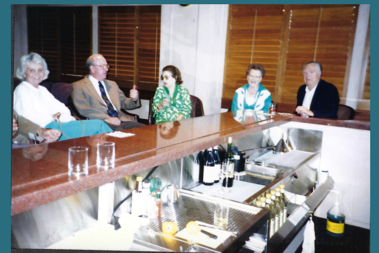
Libations at the bar in the Lounge.